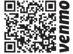
Scan QR Code to Give