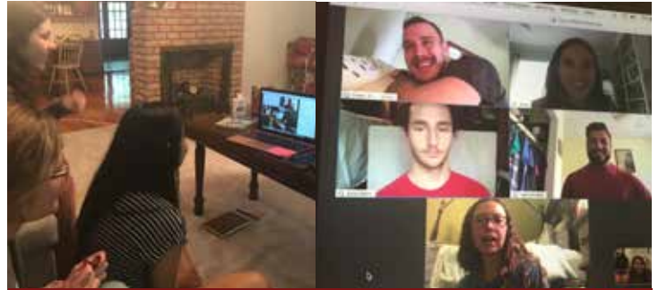
Campus Missionaries leading the daily Rosary

It is our hope that this provides a source of light in the darkness and a place where we can all come together to be strengthened and refreshed.”